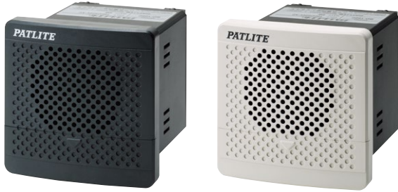
-K (Dark gray)